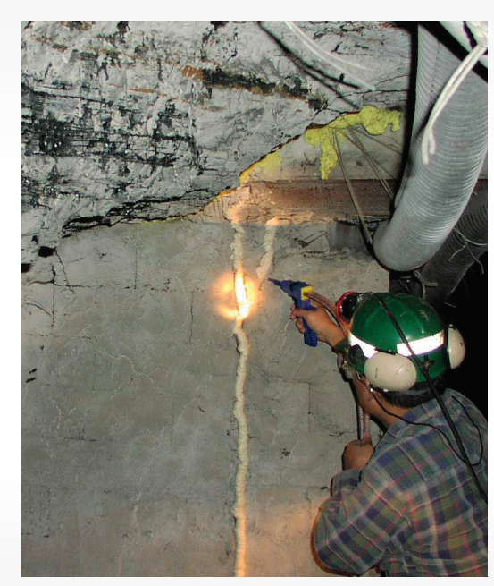
REPAIR DAMAGED BLOCK STOPPINGS