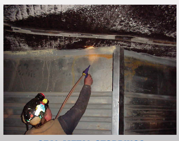
SEAL METAL STOPPINGS